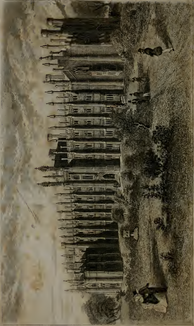
WESLEYAN THEOLOGICAL INSTITUTION, BRIMFORD.